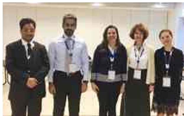
Global Summit On Pharmaceutical Science And Clinical Trials Denmark, 30th Jan-1st Feb 2017