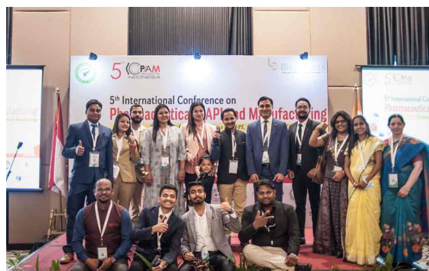
5 th International Conference on Pharmaceuticals, API and Manufacturing

Kuala Lumpur, Malaysia, 27 th -28 th November 2019