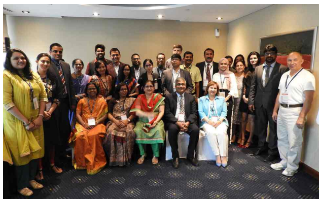
4 th World Summit on Pharmaceuticals and Drug Designs & Nanotek Summit 2018 Dubai, 21 st -22 nd Sep 2018