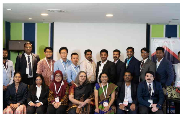
5 th International Conference on Pharmaceuticals, API and Manufacturing Indonesia, 15 th -16 th March 2019