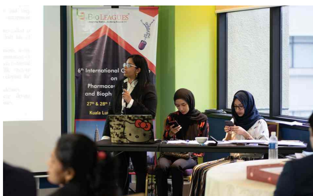
6 th International Conference on Pharmaceutical R&D and Biopharmaceutics Kuala Lumpur, Malaysia, 27 th -28 th November 2019