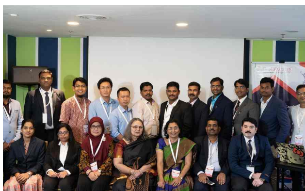
6th International Conference on Pharmaceutical R&D and Biopharmaceutics

Kuala Lumpur, Malaysia, 27 th -28 th November 2019