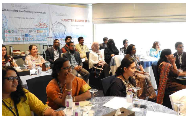
4 th World Summit on Pharmaceuticals and Drug Designs & Nanotek Summit 2018 Dubai, 21 st -22 nd Sep 2018