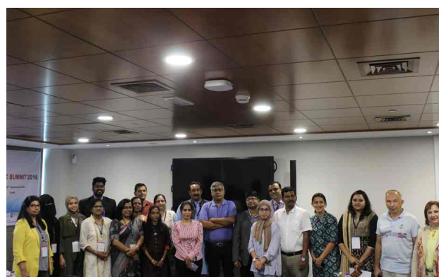
4 th World Summit on Pharmaceuticals and Drug Designs & Nanotek Summit 2018 Dubai, 21 st -22 nd Sep 2018